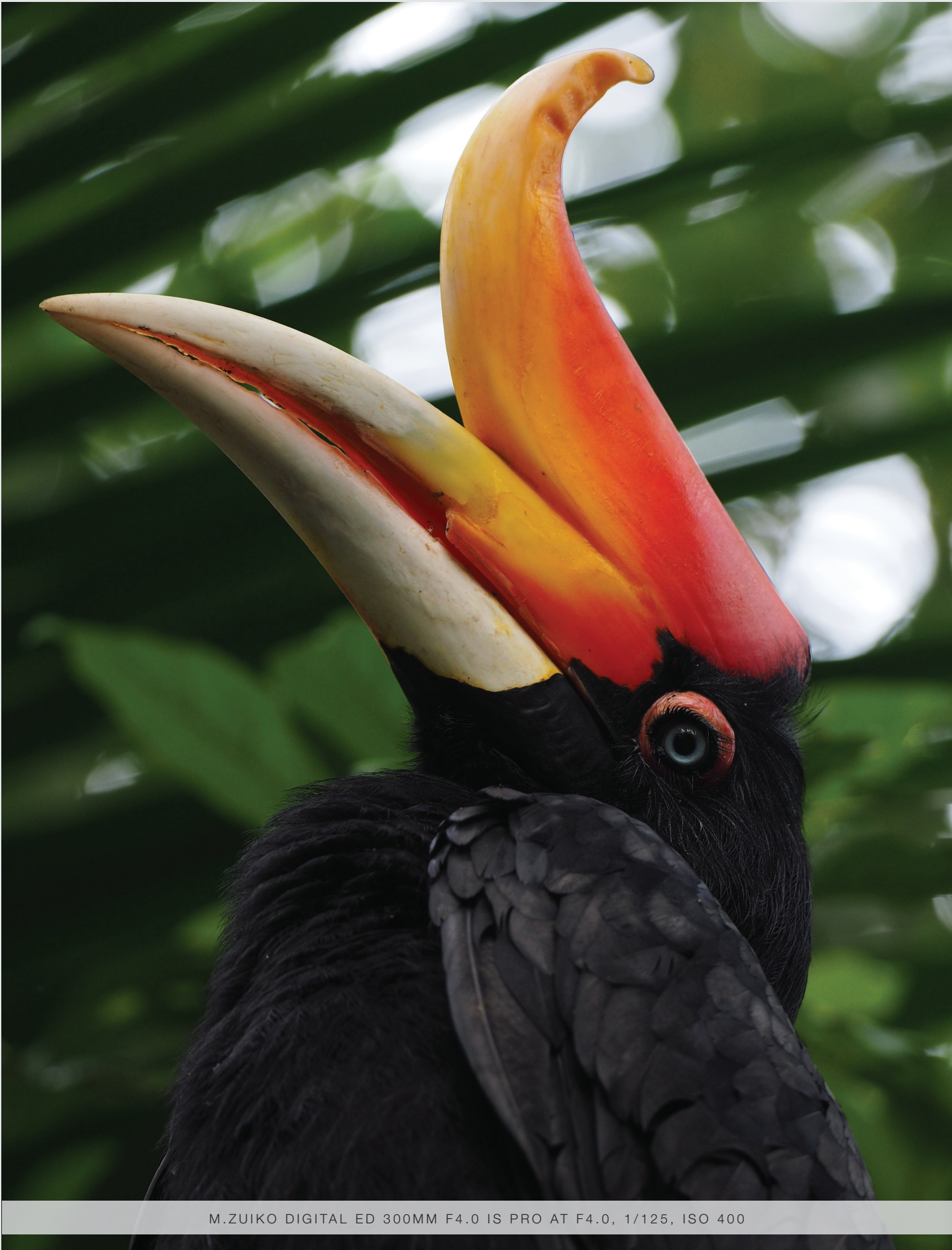
M.ZUIKO DIGITAL ED 300MM F4.0 IS PRO AT F4.0, 1/125, ISO 400

series represents a dramatic example of the portability of Olympus’ award-winning Micro Four Thirds system. Compare it to a 35mm-equivalent 600mm f4.0 lens and the size and weight advantages of the M.Zuiko are immediately obvious. This lens is great for sporting events, wildlife photography, birding and any situation where there’s a significant distance between you and your subject.