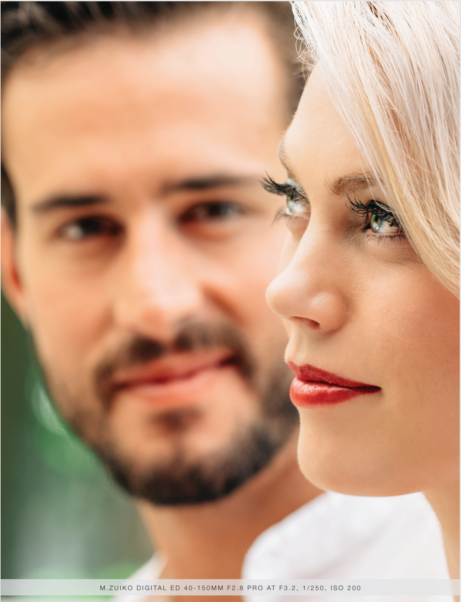
M.ZUIKO DIGITAL ED 40-150MM F2.8 PRO AT F3.2, 1/250, ISO 200

this surprisingly light lens weighs just 2 pounds and features Olympus’ industry-first dual VCM (voice coil motor) focusing system, which eliminates gears for incredibly smooth and rapid autofocus. Excellent for wildlife and fast-action sports photography, but versatile enough for wedding and portrait work.